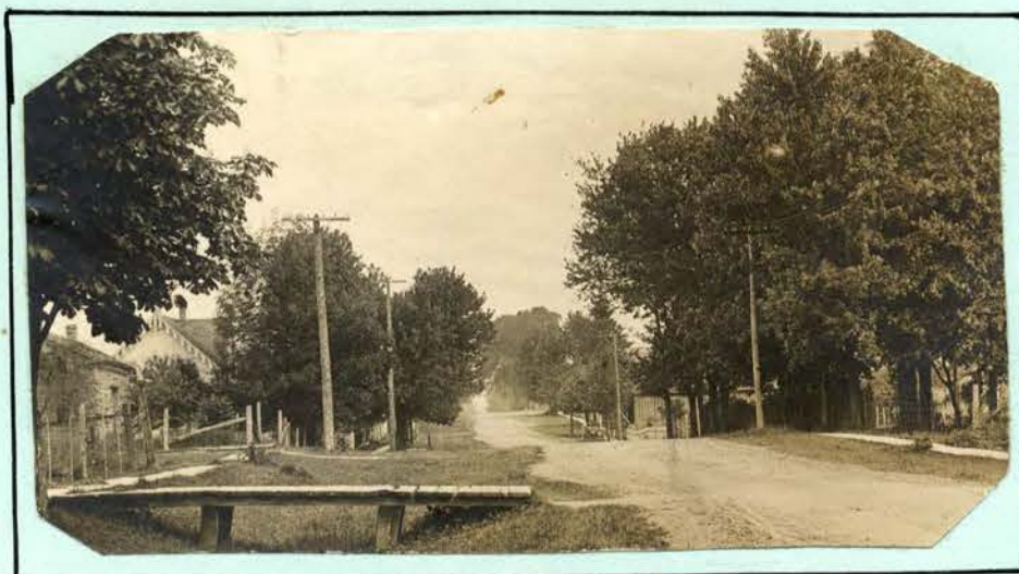
Iona Road in the Village of Iona. East side (left) showing bridge to Archie McCallum's tailor shop. House on Lot 7 (next) and Dr. McGeachy home on Lot 7. The Cascaden house is on the west side (right).